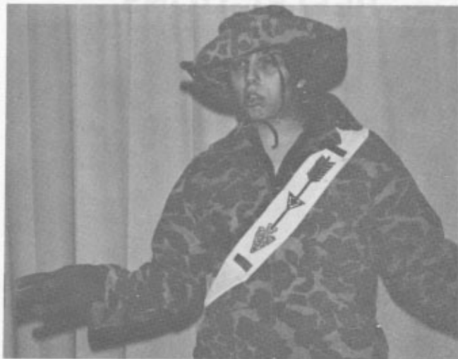
DO YOU KNOW THIS MAN??