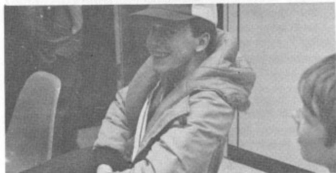
"Good Times Were Had By All"