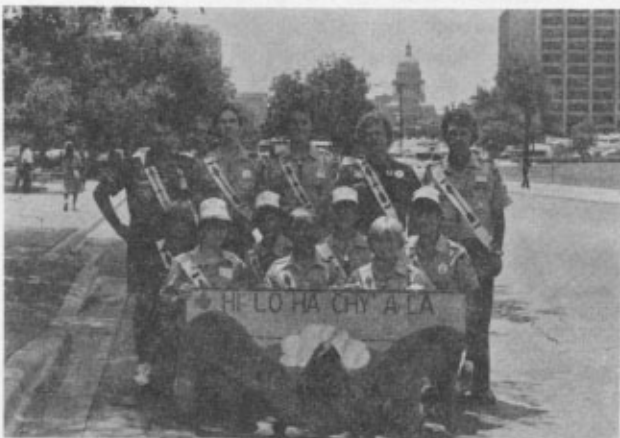
Hi Lo Ha Chy A-LA National Conference Contingent

These 10 young men and 2 adults represented our lodge in the '81 NOAC and were exposed to a week of fun and learning. The new ideas they brought back will be of great benefit to the lodge.