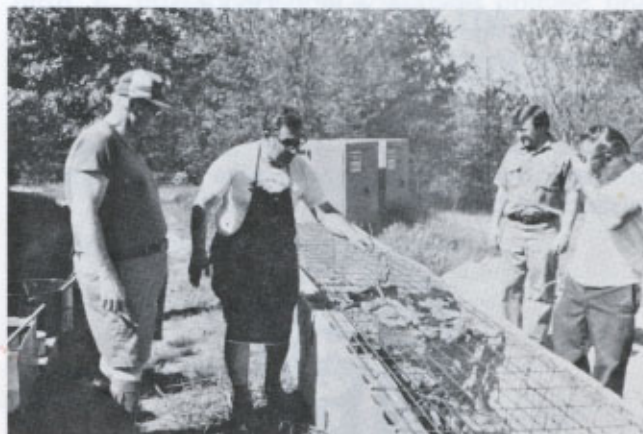
Conclave Chiefs Hard at Work