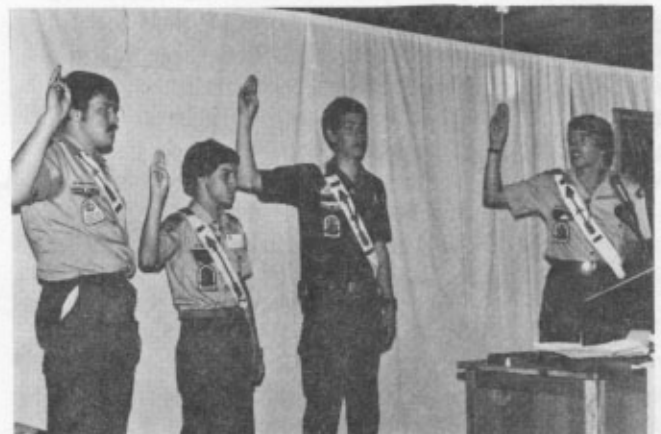
Your Section Officers And Region Chief