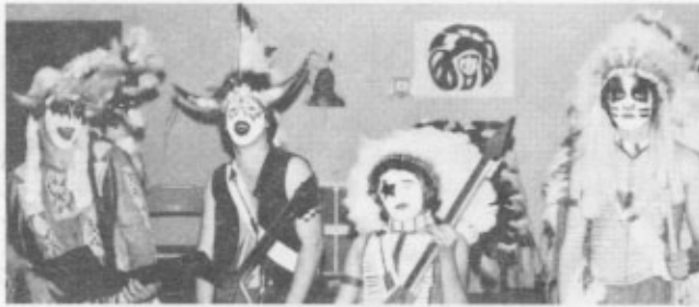
Do you know these Guys?