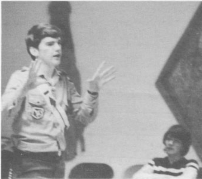
Would I Lie?