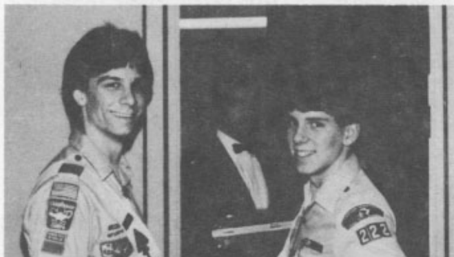
Waiter, table for two please.