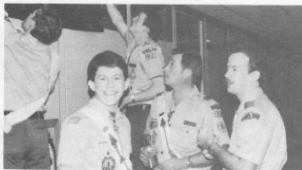
Smile when you say that!