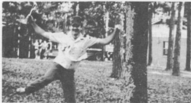
Fellowships make me jump for joy!