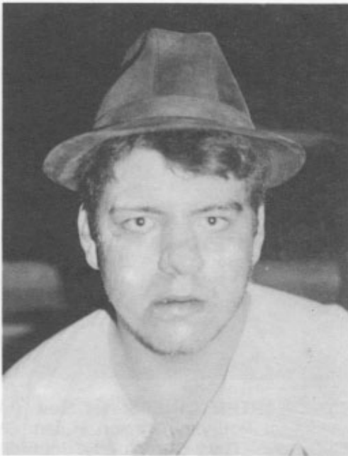
Boy, was I fired up at the '85 Klondike!