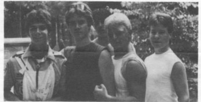
You've got the cutest little baby face