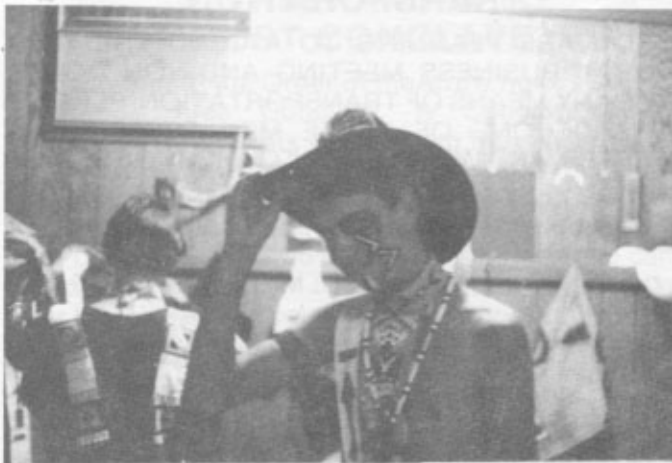
Well, hoss, it's time for me to be moseying on down the trail.