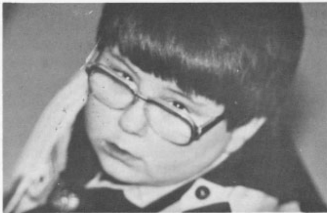
I read all the articles in the Legend! Did You?