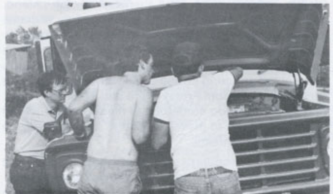
Pull the rope one more time.