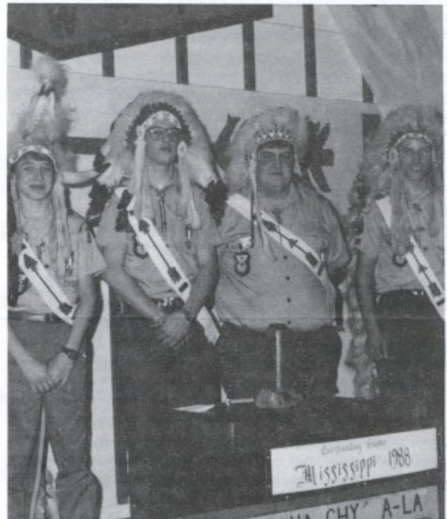
Newly-elected Lodge Officers.