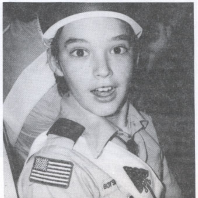
"All Astir over the Lodge Banquet"

The Lodge Banquet is an excellent chance for non-OA members to get a glimpse at some of the many worthwhile activities done by the OA and we encourage everyone to invite their parents, relatives, girlfriends, etc. to attend. Those of you who were unable to attend last year's banquet missed out on a terrific opportunity to hear and see how our Lodge has moved forward over the years and to mix with some of the outstanding past lodge and chapter leaders who helped shape the Lodge from 1949 to the present. Don't miss out on the 1990 Lodge Banquet - it's guaranteed to be a fantastic evening.