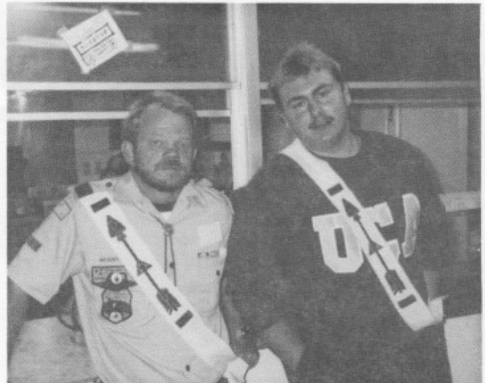
"Proper Uniforming Makes The Man"