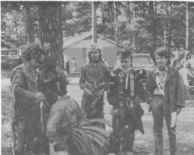
"Preparing For The Pow-Wow"

As everyone packed up talk was already beginning of next years fellowship.