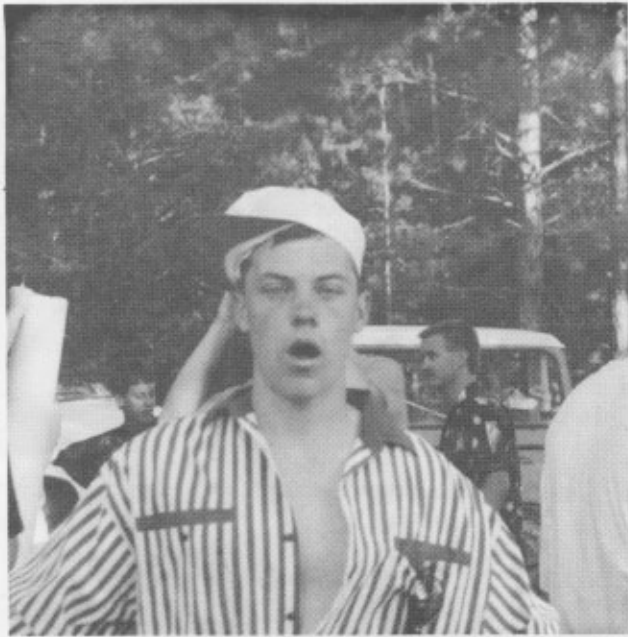
"The Camp Cedar Vally stare..."