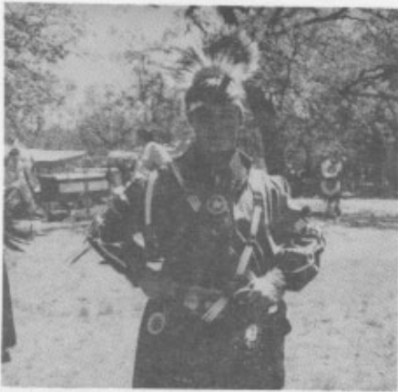
"1st Place Strait Dance Outfit"