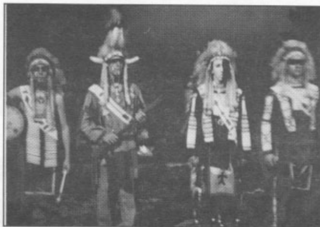
1991 Brotherhood Principles