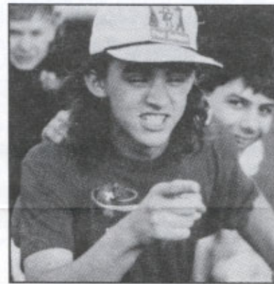
"I want YOU at Fall Fellowship!!"