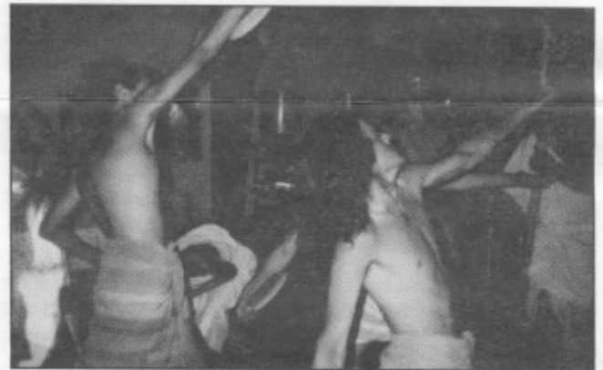
Onward to Klondike!!!!

Arrowmen, it's been said many times that we need to promote Winter Camp and events. Let's all join together and see if we can promote Winter Camp and have a true happy holiday. Besides, when else can you prove that your troop can survive in the wilderness and come out above all other patrols. Don't be left out in the cold, be one of the few, the proud, the Klondike participants. Klondike '91; We're looking for a lot of good men.