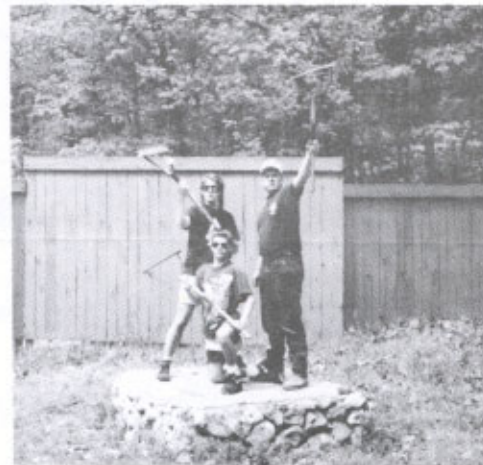
The Cedar Valley Swingblade Crew is waiting for you! Serve your camp and join them at the '92 Ordeal.

Each arrowman should also bring a medical form. If you would like, bring your '92 summer camp form. We will return it to you at the end of the weekend.