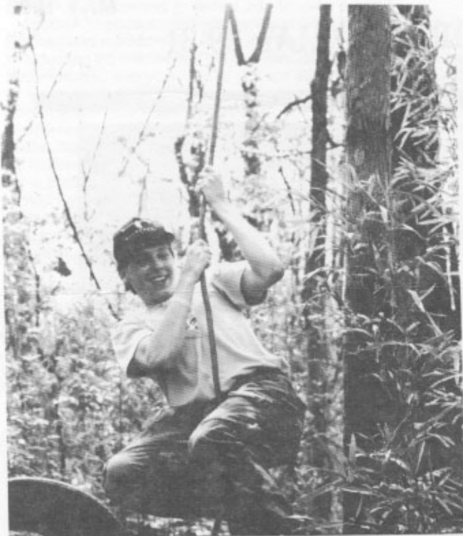
Swing by the brotherhood ceremony this year...either as a candidate or member.