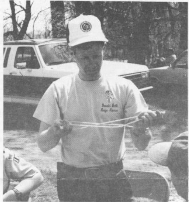
"I can't wait for Summer Camp so that I can brush up on my knot tying skills. Cedar Valley will be great, so why not attend?"