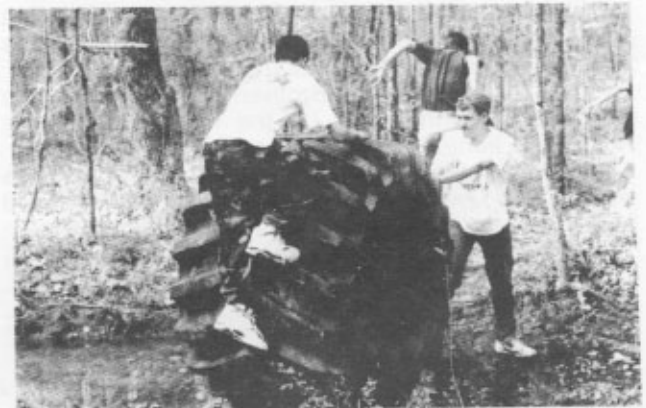
If you're "tired" of the same old summer, hit Viola in '92, where a new adventure is always "rolling" your way.