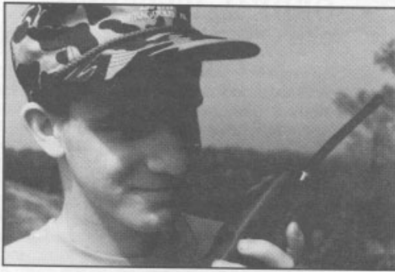
"I wonder if Grommett knows who I am?"