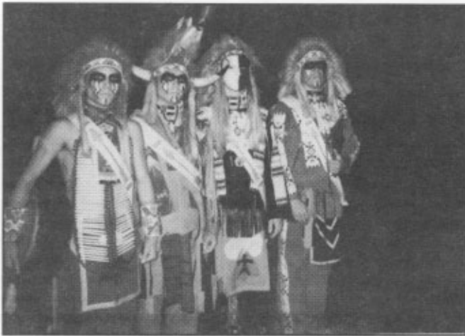
1992 LODGE OFFICERS