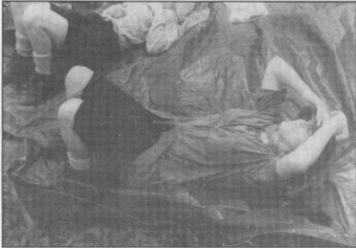
If you're tired of the same old everyday camping, come to camp Cedar Valley where the ultimate adventure awaits you.