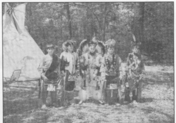
We danced at our new section Conclave. How about you?