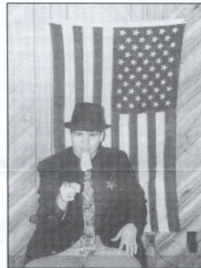
Uncle Sam says: "I want You for Ordeal '93!"

The Ordeal ceremonies Saturday night will begin at 8:30 p.m. in their respected sites. This will be the first year for the new chapter pairings and ceremonies, so let's give the candidates a ceremony to remember. Following the ceremonies