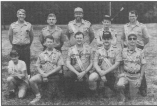
1993 Vigil Class and Sponsors