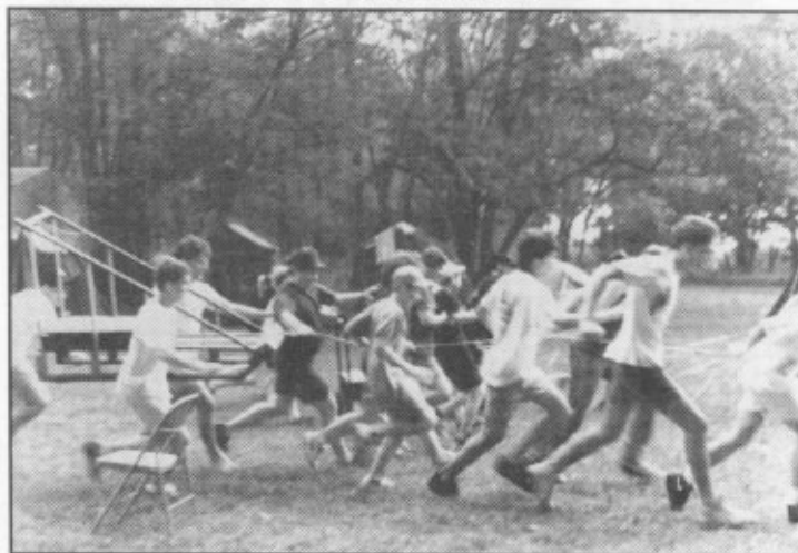
All Aboard; Next stop, Klondike '93

As Order of the Arrow members and honor campers, it is now time to do our part to promote Winter Camp. Encourage yours and other troops in your area to attend this chilling event. So start working on repairing those sleds today so your troop doesn't miss out on the fun of Klondike!