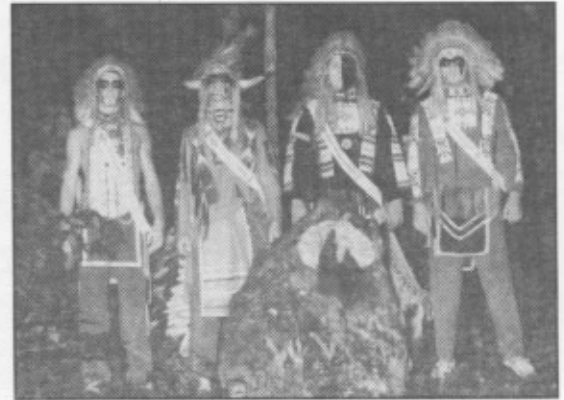
1993 Brotherhood Principles

A special congratulations is in store for these folks when you see them at Fall Fellowship. Let's make them welcome!!