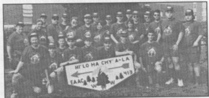
1994 NOAC Contingent

Well, a journey for 28 sure was an adventure for many. Good times and adventure is just what NOAC '94 was and that is just what we did. Thanks go out to everyone who helped drive and make this NOAC another great experience.