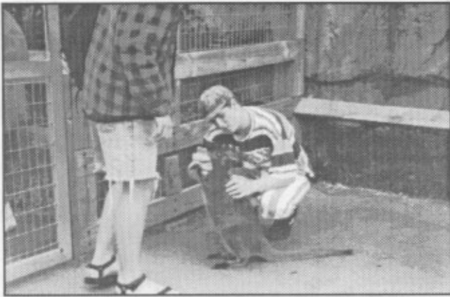
Come to Fellowship and make new friends!