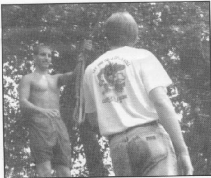
Swing into Adventure at the '95 Fall Fellowship!

A special thanks goes out to each arrowman who returned to camp this summer to bring his troop.