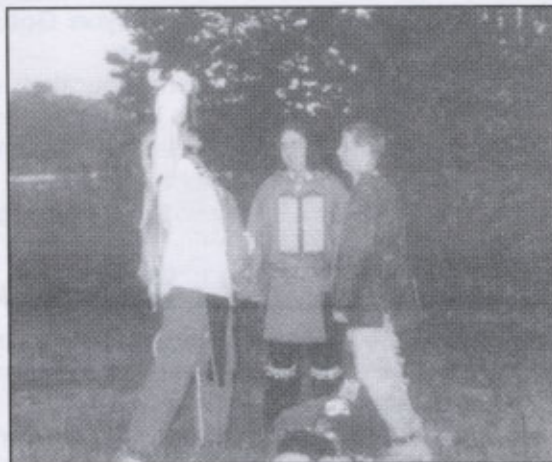
"Come to the 10th Annual Lodge Banquet and enjoy fine dining!"