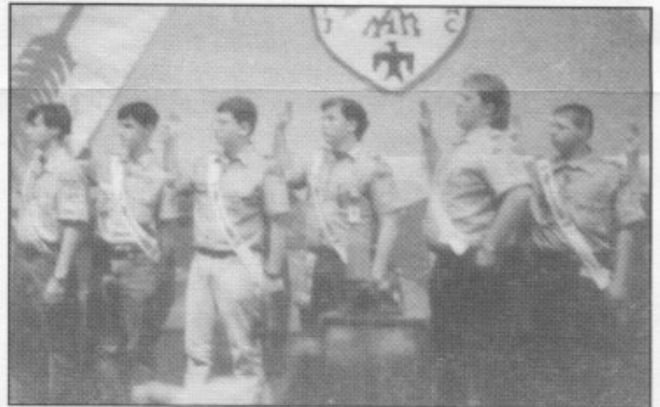
"Are you prepared to fulfill your promise?"

After a day of fun and learning, the chapter officers departed, filled with knowledge and the spirit of the O.A. On second thought, perhaps they were filled with pizza and Mountain Dew.