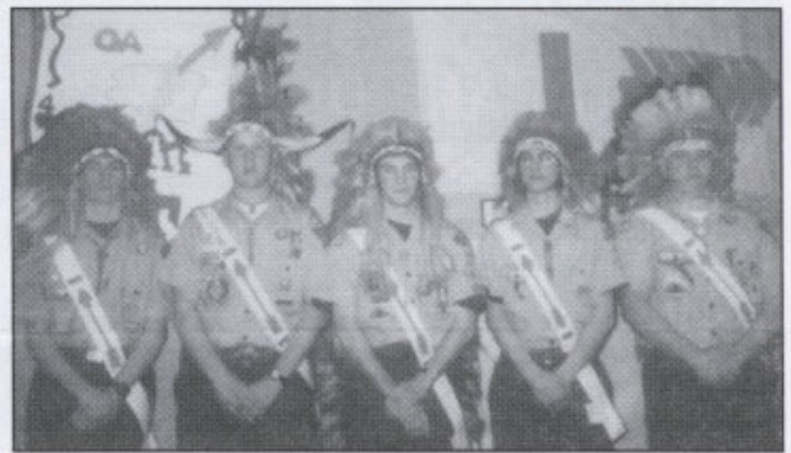
The 1998 Lodge Officers take the oath.