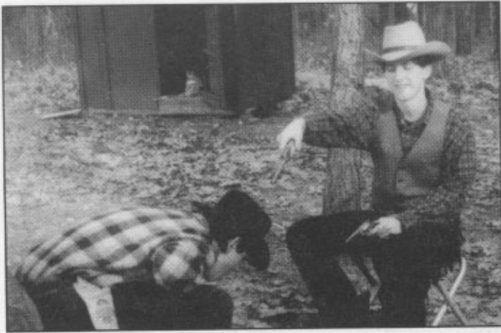
You'd better get your Brotherhood, boy!