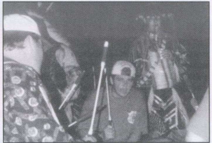
I hope I don't miss Ordeal!

If you have any questions call one of your friendly Lodge or Chapter Officers.