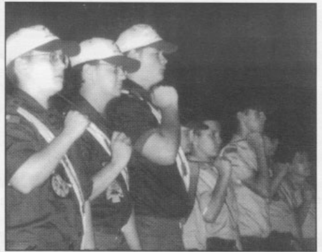
We got our Brotherhood. Will you get it next summer?

I'll tell you what you can do at Klondike. You can take your cool sled, and go to all the cities, and do a fun activity, and loot all the gold nuggets you can carry. All you have to do is go and have fun! Yes! you get paid to have fun! Isn't it great! I can hardly believe it myself! See ya there! Hey, and maybe with all this El Nino junk that has been goin' on since last year, it just might snow! I guess you'll have to come and find out for yourself.