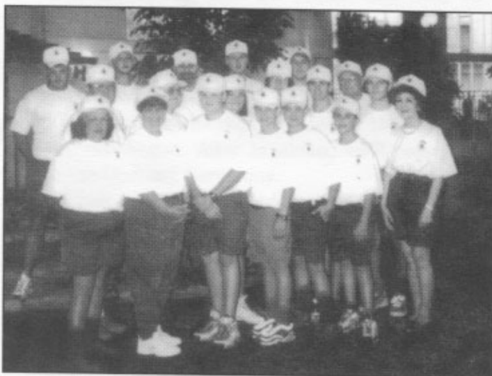
1998 NOAC Contingent

The next NOAC will be in Knoxville, TN in the year 2000. If you are interested in going but you think that it is too expensive, begin saving your money and making your plans immediately. An experience like this does not come around too often. Take advantage of it while you can.