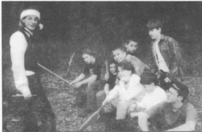
Come join the fun at Klondike.

Fall Fellowship.....October 30 - November 1 Winter Camp.....December 11 - 13 Officer Training Meeting.....December 19 Lodge Banquet.....January 30