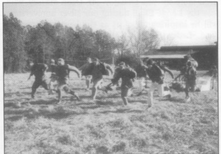
"It's time to run over to the Lodge Banquet!"

Everyone who attended Klondike this year will probably never forget it, in fact, they will probably tell their grandchildren about someday. For most of the day Saturday, it rained like the dickens! But, everyone managed to have loads of fun anyway. The weather had no effect on the high spirits of every young lad there. Sure Klondike was wet, but it was still amazing as usual.