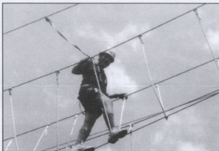
"Climb on over to the 11th Annual Lodge Banquet"