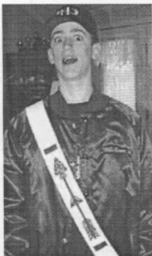
It could happen!

Boy Scouts of America P. O. Box 146 Jonesboro, AR 72401