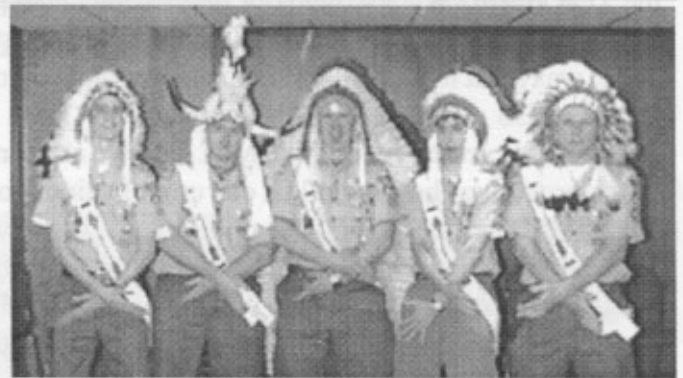
The 1999 People's Lodge Officers have 2 words for you... Cheerful Service!