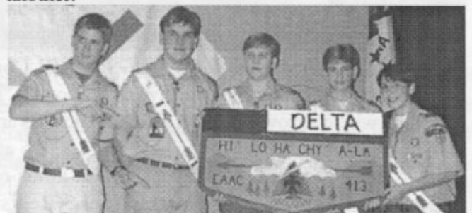
Our hope for the future?