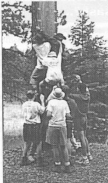
"I think the arrow is up here."

Now, you may be asking yourself, how much could a weekend of helping to prepare camp for the summer and the best food, entertainment, and fellowship this side of the Mississippi cost? Well, for a member in good standing, it is a mere $15. And if you are behind on your dues, just bring an extra $8. Candidates have to pay $30, but they get lots of neat stuff that you don't, like a sash and lodge flap. Also, don't forget to fill out and bring the enclosed health form (the front side only). Also, if you want any of the handy-dandy stuff from the OA trading post, you will need to bring more wampum.