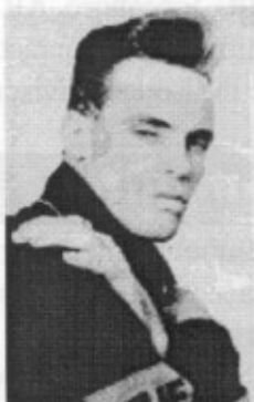
Ordeal '99 is Cool as ICE!!!

Boy Scouts of America P. O. Box 146 Jonesboro, AR 72401