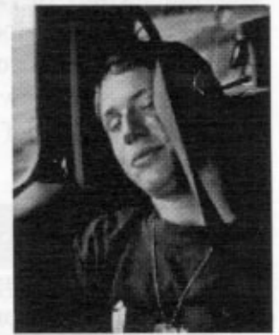
"Wake me up when we get to Ordeal!"

Question number two: Is there anything I should bring other than my usual camping gear and work clothes? Well, actually, if anyone has any Indian outfitting, there will be a pow-wow Saturday night. Even if you are just getting started, this is a great chance to practice up.