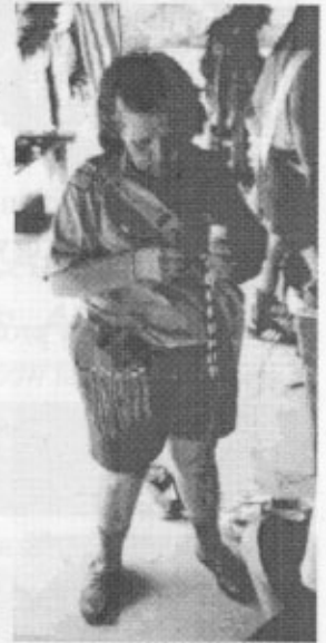
...The rabbit goes out of the hole, around the tree...

I know that this article only skims the surface of how much fun a trip is with our Lodge, but you can find out which lodge is your daddy at the next Lodge event, such as Ordeal or Fall Fellowship.