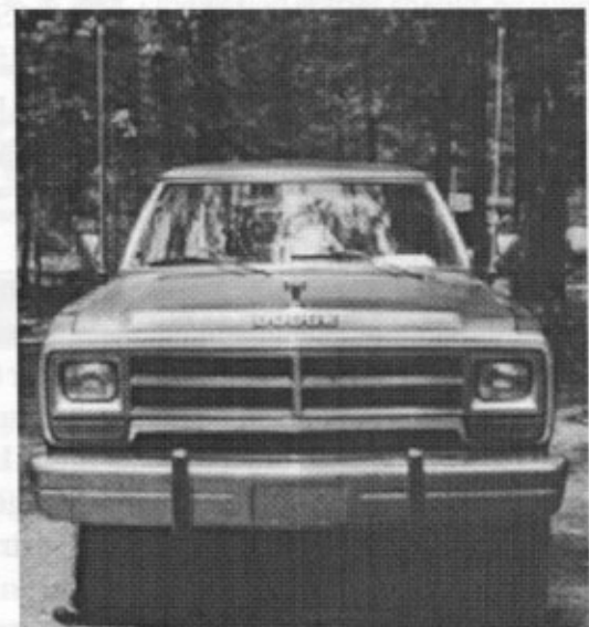
Don't Foo-Foo around and miss Ordeal!!!

Remember, friends don't let friends miss Ordeal.