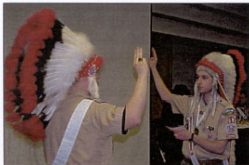
"...to defend the Constitution of the United...wait a second, this is the wrong oath!"

We were then blown away again with an amazing slide show, which was followed up by the installation of the 2001 Lodge Officers. The OA Song was then sung and the 2000 Lodge candle was extinguished for the last time.